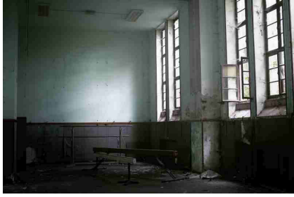
Internat - gymnase