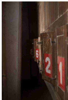
Usine - casiers