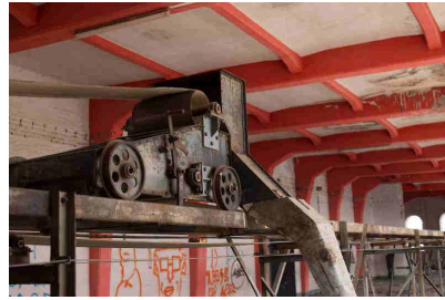
Usine - chariot