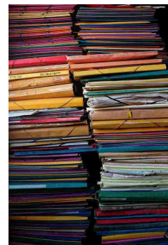
Usine - dossiers

Cartes postales : format 10x15 2 € l'une