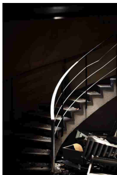
Usine - escalier