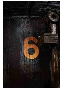
Usine – cuve '6'